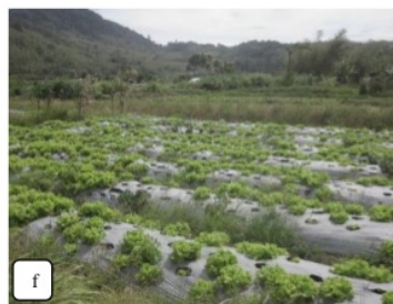
Figure 2. The pattern of intercropping by cultivate two types of plants by local ethnic in the Doulu village, Karo District, North Sumatra.