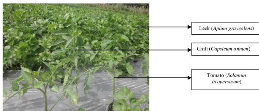
Figure 3. The pattern of intercropping by local communities in the Doulu village through cultivation of three of plants types are celery ( Allium porum ), tomato ( Solanum lycopersicum ) with chilli ( Capsicum annum ) a time.

The plants that intercropping by farmers in Doulu village are annual plants with at harvest about 3-4 months. Those resulted that farmers can income in each month. The plant that intercropping have different in height. For example: the height of celery, chili and tomato are 25 cm, 100 cm, and 150 cm respectively. Those showed that the farmers in the Doulu village have understood of characters and growth of plants which they choose in intercropping. Intercropping used three types of plants in this research has not been found in the other local communities.