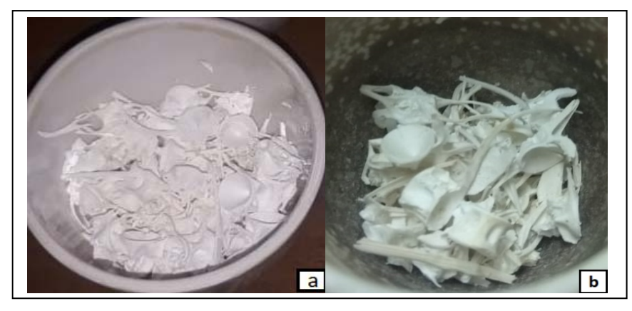
Fig. 3. CaO results from calcination of Tuna Bone at a temperature of 1000 °C(a). For 6 hours (b). For 10 hours

When compared to samples calcined for 6 hours and 10 hours, it can be concluded that both produce CaO compounds. But to proceed to the stage of synthesis of hydroxyapatite CaO compounds used is a cao compound from calcination results for 10 hours. This is because the longer the sample is dikalsinasi it will produce better CaO quality (Nya Daniaty Malau, 2021).