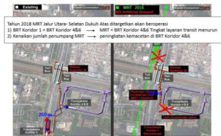
Figure 7. MRT-BRT Passenger Transit Line corridor 1 and Corridor 4 and 6.

of time. By 2020 it is hoped that The Airport Railway, MRT and LRT planned in the area will be able to operate perfectly. But if this facility is built in a scattered way, with no coordination at all, then there are no integrated transit lines or safe and smooth access from various areas of Dukuh Atas.