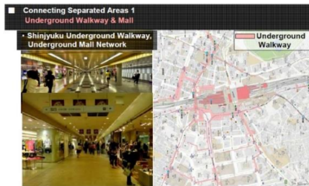
Figure 3. Shinjuku station underground network.

To eliminate the separation of areas on various levels (underground, at ground level and above ground), the planning also secures the visual connection of the underground and above-ground areas through a sunken garden in the front rotary station at Shinjuku Station. West Entrance, a pavilion staircase at Shinjuku station's South Entrance and beyond. Planning underground and above ground centred on large spaces, a public space called Mosaic Hill has also been built between the city and high-volume blocks to provide a comfortable environment for pedestrians.