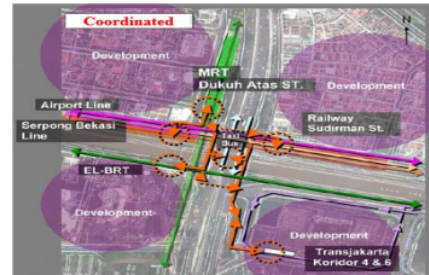
Figure 8. Coordinated future transit lines.