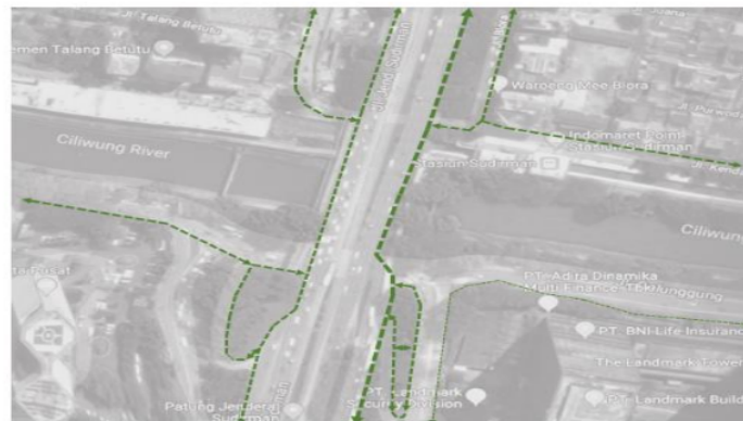
Figure 9. Pedestrian circulation.

Circulation analysis is divided into several parts, namely vehicle circulation analysis and pedestrian analysis. Road conditions in the area around the land have a high density, Kendal road width is 8 meters. This road is a one-way street. The pedestrian walkway is located on Sudirman street corridor and along the outskirts of Banjir Kanal. Pedestrian intensity increases during office hours (7am-9am) and office hours (4.30pm-6pm). Majority pedestrians are workers in Sudirman and Thamrin areas.