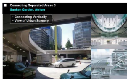
Figure 4. Shinjuku Station-front area above the Ground Walkway.

To eliminate the separation of areas on various levels (underground, at ground level and above ground), the planning also secures the visual connection of the underground and above-ground areas through a sunken garden in the front rotary station at Shinjuku Station. West Entrance, a pavilion staircase at Shinjuku station's South Entrance and beyond. Planning underground and above ground centred on large spaces, a public space called Mosaic Hill has also been built between the city and high-volume blocks to provide a comfortable environment for pedestrians.