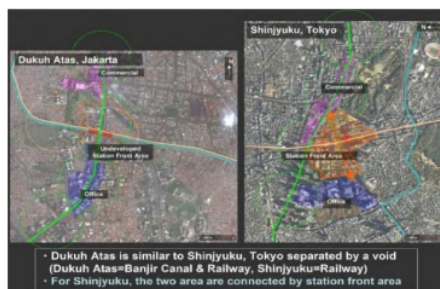
Figure 1. Planning conditions.