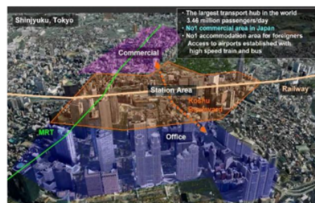
Figure 2. Planning conditions.

Shinjuku Station's underground area connects the east and west by creating underground passageways and underground shopping malls that take advantage of the area on Tokyo's Marunouchi Metro Line and provide underground access to the surrounding area as well as an above-ground network created by pedestrians and artificial lands on trains at Shinjuku Takashimaya. Department Stores and Commercial Zones to the south connecting areas that being cut off by stations. Construction of the bus and taxi terminal that is connected with Shinjuku Station is also underway.