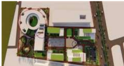
Figure 12. Orientation concept 1.

The path concept in the Blind Orphanage is divided into 3 paths namely public zone with vertical and horizontal straight line, Semi Public Zone with slope or zig - zag path and Private Zone with curved path. It provides training to visually impaired children about different orientation pathways when often going through them. The difference in paths also makes the visually impaired children considering what terrain he or she went through when in a particular zone. Providing a fountain that serves as a beauty and gives a sense of moisture to make the surrounding air feel cooler but for visually impaired students the fountain is functioned as a marker of orientation of direction through the sound of splashing water. The laying of the Fountain is planned at each intersection between one zone to the other to indicate each direction of the intersection.