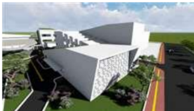
Figure 16. Light concept 1.

The use of the opening shape varieties will make the shape of light that enters each room varies. This can make it easier for low-vision people to identify rooms. The opening shapes used are square, circle, and rectangle openings in the form of Voids.