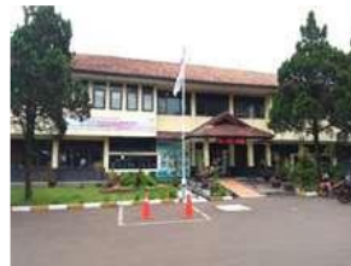
Figure 2. PSBN Wyata Guna building.