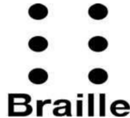
Figure 15. Material Concept 2.