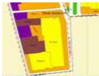
Figure 5. Site space rules location.

The location of the site is on Jalan Gunung Sahari, Kemayoran Central Jakarta. The North is bordered by MP Strada Mardi Utama, the east bordering people housing, the west bordering the Ministry of Defence of the Republic of Indonesia, the south bordering BPK Penabur 3 Christian High School. The area of KDB 40/5 is 6,600 m 2 , the area of kLB 2.4 is 26,400 m 2 , the maximum building height is 4 layers, the minimum KDH is 30% which is 3,300 m 2 , KTB 55% is 6,050 m 2 , and GSB 7 meters.