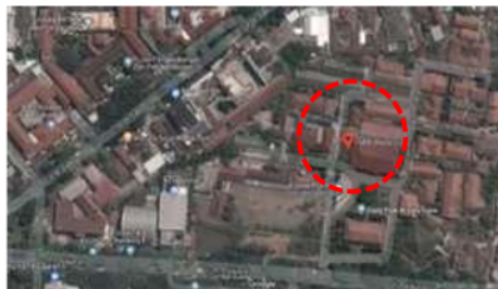
Figure 1. Map location.

The first comparative study in this research, which is at PSBN Wyata Guna is a technical implementation unit in the field of rehabilitation and social services in the ministry of social affairs, under and directly responsible to the Director General of Social Rehabilitation of the Ministry of Social Affairs located at Jl. Pajajaran No.52, Pasir Kaliki, Cicendo, Bandung City, West Java.