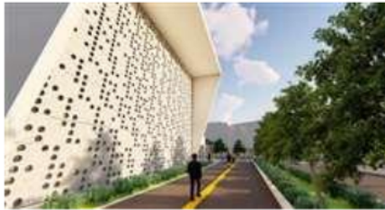
Figure 14. Material concept 1.