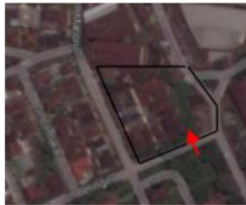
Figure 4. Site Plan UPT Rehabilitasi Cacat Netra.