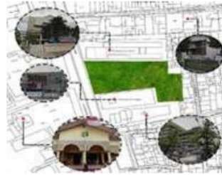
Figure 8. Nearby facilities.