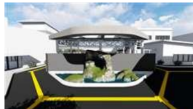
Figure 13. Orientation concept 2.