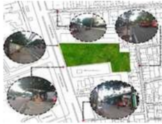
Figure 7. Condition of research site.