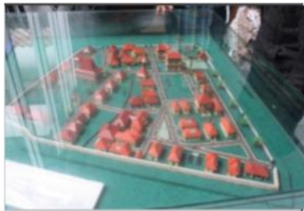
Figure 3. Location mockup.