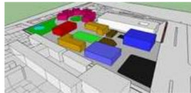
Figure 10. Final mass custom.