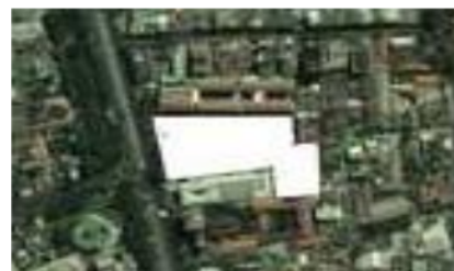
Figure 6. Tread shape.

The site is located on Jl. Gn Sahari precisely in kemayoran area. Reviewed by its position on various activity centres in Jakarta, the location of the site is considered as a strategic point because of it is relatively close location to Social Services Office, Police Station and Education Office.