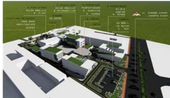
Figure 11. Building mass concept.