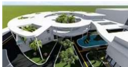
Figure 17. Light concept 2.