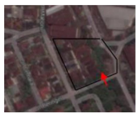
Figure 4. Site Plan UPT Rehabilitasi Cacat Netra.