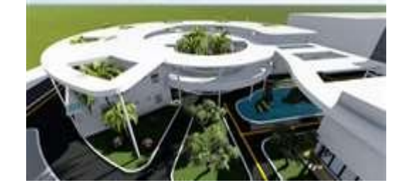
Figure 16. Light concept 1.