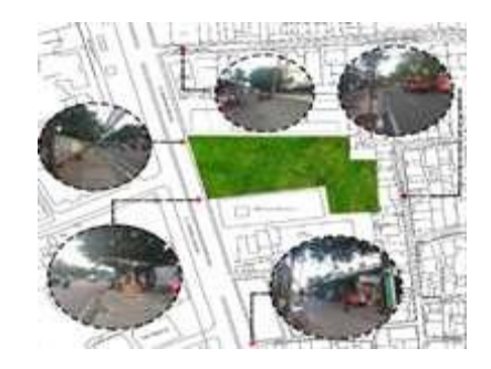
Figure 7. Condition of research site.