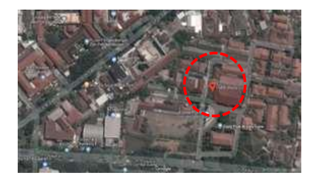
Figure 1. Map location.

The first comparative study in this research, which is at PSBN Wyata Guna is a technical implementation unit in the field of rehabilitation and social services in the ministry of social affairs, under and directly responsible to the Director General of Social Rehabilitation of the Ministry of Social Affairs located at Jl. Pajajaran No.52, Pasir Kaliki, Cicendo, Bandung City, West Java.