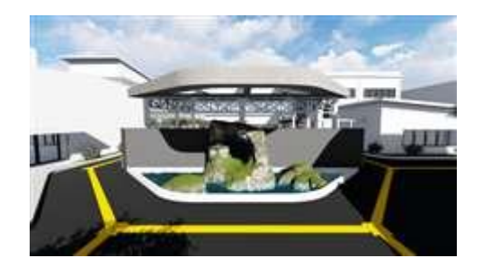
Figure 13. Orientation concept 2.