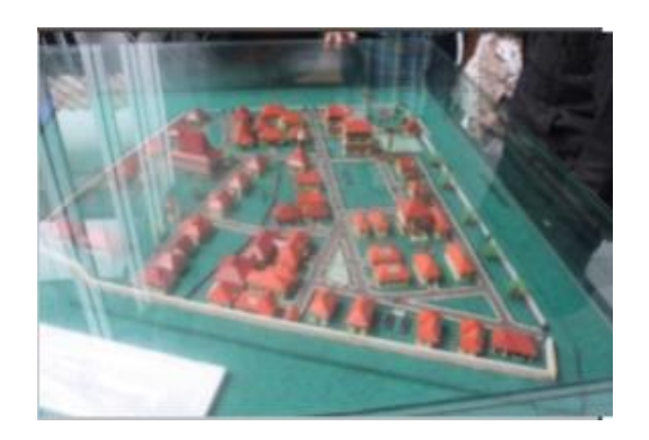
Figure 3. Location mockup.