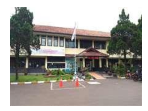
Figure 2. PSBN Wyata Guna building.