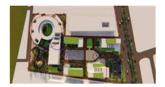
Figure 12. Orientation concept 1.

The path concept in the Blind Orphanage is divided into 3 paths namely public zone with vertical and horizontal straight line, Semi Public Zone with slope or zig - zag path and Private Zone with curved path. It provides training to visually impaired children about different orientation pathways when often going through them. The difference in paths also makes the visually impaired children considering what terrain he or she went through when in a particular zone. Providing a fountain that serves as a beauty and gives a sense of moisture to make the surrounding air feel cooler but for visually impaired students the fountain is functioned as a marker of orientation of direction through the sound of splashing water. The laying of the Fountain is planned at each intersection between one zone to the other to indicate each direction of the intersection.