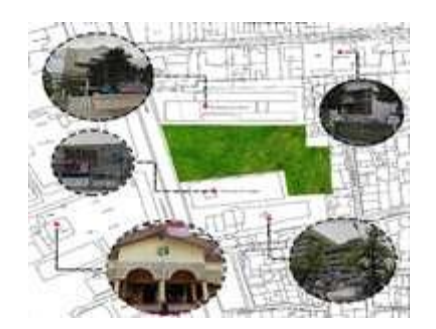
Figure 8. Nearby facilities.