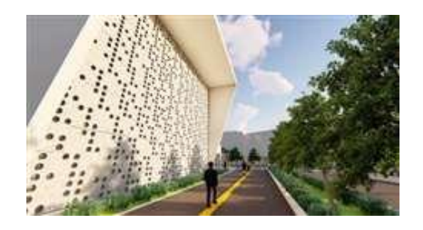
• • • • Braille