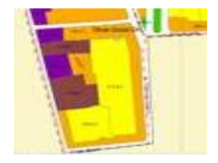
Figure 5. Site space rules location.

The location of the site is on Jalan Gunung Sahari, Kemayoran Central Jakarta. The North is bordered by MP Strada Mardi Utama, the east bordering people housing, the west bordering the Ministry of Defence of the Republic of Indonesia, the south bordering BPK Penabur 3 Christian High School. The area of KDB 40 5 is 6,600 m2, the area of kLB 2.4 is 26,400 m2, the maximum building height is 4 layers, the minimum KDH is 30% which is 3,300 m2, KTB 55% is 6,050 m2, and GSB 7 meters.