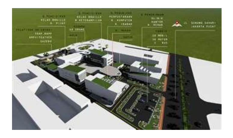
Figure 11. Building mass concept.