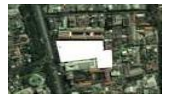
Figure 6. Tread shape.

The site is located on Jl. Gn Sahari precisely in kemayoran area. Reviewed by its position on various activity centres in Jakarta, the location of the site is considered as a strategic point because of it is relatively close location to Social Services Office, Police Station and Education Office.