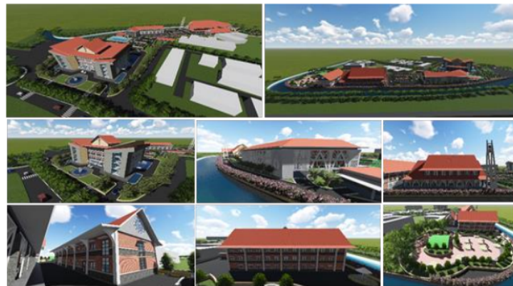
Figure 3. The exterior of higher seminary.