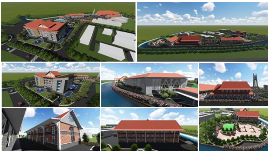
Figure 3. The exterior of higher seminary.