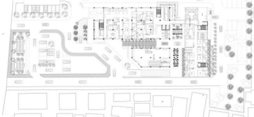
Figure 3. Site plan.

3.3.2. The building analysis: The space requirements approach includes physical requirements, ventilation, lighting and sound acoustics in space. The spatial arrangement of the building and its use must be in accordance with the function and fulfill health requirements, namely by classifying the rooms according to the level of risk of disease transmission. Based on the Decree of the Minister of Health of the Republic of Indonesia No. 1204/MENKES/SK/X/2004 Regarding the Requirements for Environmental Health for the Hospital, the grouping is divided as follows: 1) Low Risk Zone, the low risk zone includes: administration room, computer room, meeting room, and reception room. The requirements are: the surface of the walls must be flat and lightly colored, the floor must be made of strong material, easy to clean, waterproof, light-colored, and the meeting between the floor and the wall must be in the shape of a conus, the ceiling must be made of a multiplex or strong material, light color, easy to clean, the frame must be strong, and a minimum height of 2.70 meters from the floor, the