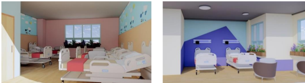
Figure 4. The interior of children's hospital design.