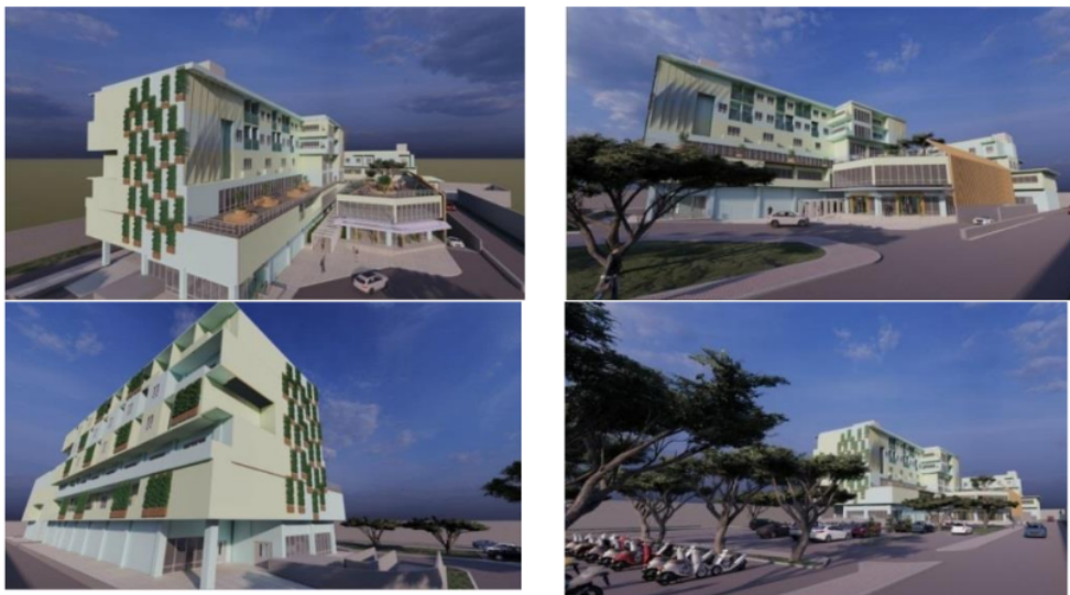
Figure 5. The exterior of children's hospital design.