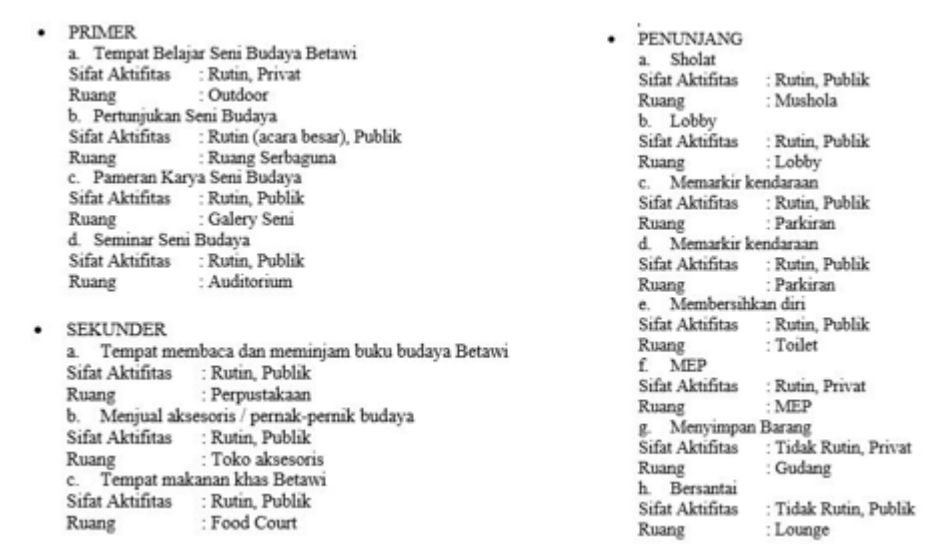
Figure 4. The classification.

Activity analysis at betawi Arts and Culture Center is classified by type of function. The classification can be seen on figure 4 below: