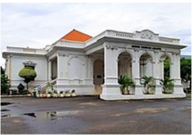
Figure 1. Taman Ismail Marzuki grand theatre.