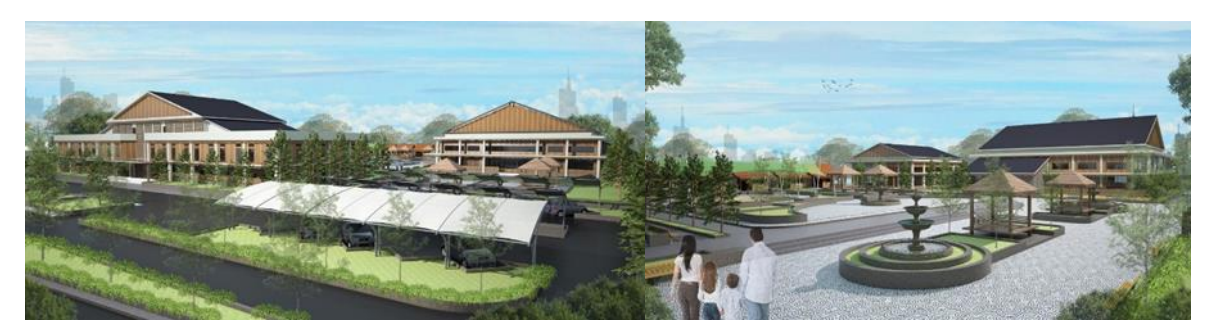
Figure 13. Application of concept in design.