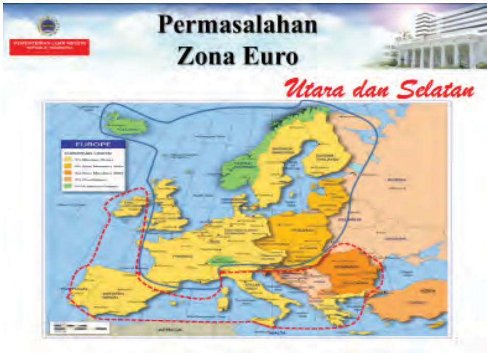
Figure 3: Euro Zone Issue - North and South