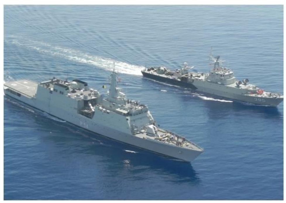
Figure 3. Indonesian and Indian Vessels during the Ind-Indo Corpat Source: Indian Navy. "CORPAT- India-Indonesia Coordinated Patrol", in https://www.indiannavy.nic.in/content/corpat-india-indonesia-coordinated-patrol retrieved January 18th 2017.

Principals of the coordinated patrol implementation would be different with the joint-patrol. Coordinated patrol is conducted in the borderline of each countries, both countries will coordinate to report the condition during the operation. Meanwhile the joint-patrol is conducted by entering the specific area and conduct the patrol altogether. Ind-Indo Corpat is conducted in the jurisdiction areas of each countries by implementing the preventive operation or the early detection towards the threats and inspection to the marine-users.