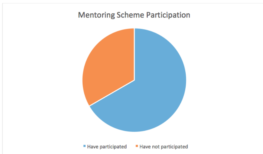
(N*: Number of respondents = 12 participants) Figure 3: Participants’ experiences on mentoring practices

The results below show how the participants first met the term mentoring. In questionnaire Section C number 2, participants were asked where they had first met the term ‘mentoring’ and table below shows the results.