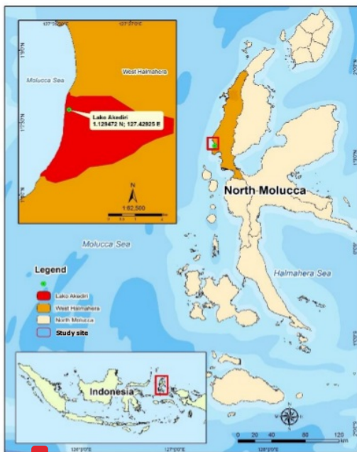
Fig 1. Study site at Lako Akediri Village Sub District Sahu, District West Halmahera, North Moluccas - Indonesia

The study was conducted at Lako Akediri Village (Fig. 1), on May - June 2014 and October 2014. Lako Akediri Village (Fig. 2) is geographically located on coastal area 27^{\circ}22'17.323'' – E 127^{\circ}37'5.214'' and N 0^{\circ}58'13.505'' – N 1^{\circ}8'5.332'' . Total area of Lako Akediri Village is 10 hectares, which located at an altitude 31 meters above sea level with average rainfall 15 mm/month (16) . The population in 2014 was 344 people; 175 males and