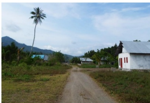
Fig 2. The Lako Akediri Village on Sub District Sahu

169 females, with number of households were 85. As many as 98% community at Lako Akediri Village come from Sahu tribe, while the rest are ethnic immigrants, such as Buton, Bugis, and Sasak. The agricultural plants at Lako Akediri Village are tubers, corn, coconuts, clove, and nutmeg (16) .