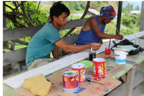
Figure 3: Plank painting process

Then the question arises why you have to make a mal first before drawing a Gorga? Can we draw directly without using the mal? From the results of the carvers' answers it was found that the carvers must use the mal so that the images obtained are more precise in terms of distance, shape and size. The more precision the resulting image, the more beautiful the engraving will be formed. Carvings drawn using the mal will look more beautiful than those without.