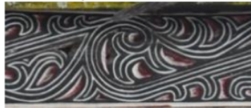
Figure 2: Examples of mal

Although the sculpture of the Gorga looks complicated, it is created using one simple basic pattern. Each Gorga carving has a basic pattern called "mal" (fig.2). Generally, the stages of making gorga are drawing mal, plagiarizing, carving, and painting (fig.3). The first step to making a Gorga is drawing a mal. These basic patterns will be used as a template to draw motifs throughout the board to be carved. In ancient times the mal was painted on bark or leather. Currently, carpenters usually use cardboard to draw mal.