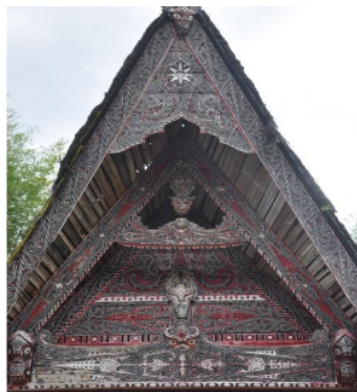
Figure 1: Gorga in the Batak Traditional House

Gorga is a traditional carving of the Batak people that has existed for hundreds of years. As a work of art inherited from generation to generation, gorga has a symbolic and philosophical meaning for the Batak people (Ditasona, 2018). Nowadays gorga can not only be found on the walls of traditional houses, we can also observe gorga on the walls of government offices and public facility buildings in the Tobasa and Samosir areas.