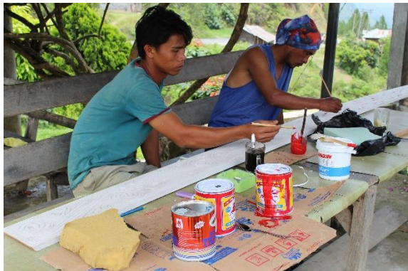
Figure 3: Plank painting process

Then the question arises why you have to make a mal first before drawing a Gorga? Can we draw directly without using the mal ? From the results of the carvers' answers it was found that the carvers must use the mal so that the images obtained are more precise in terms of distance, shape and size. The more precision the resulting image, the more beautiful the engraving will be formed. Carvings drawn using the mal will look more beautiful than those without.