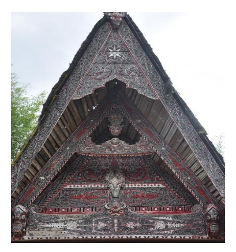
Figure 1: Gorga in the Batak Traditional House

Gorga is a traditional carving of the Batak people that has existed for hundreds of years. As a work of art inherited from generation to generation, gorga has a symbolic and philosophical meaning for the Batak people (Ditasona, 2018). Nowadays gorga can not only be found on the walls of traditional houses, we can also observe gorga on the walls of government offices and public facility buildings in the Tobasa and Samosir areas.