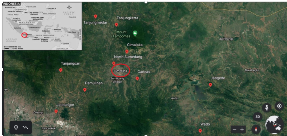
5 Figure 3. Map of the study area in Sumedang District, West Java, Indonesia