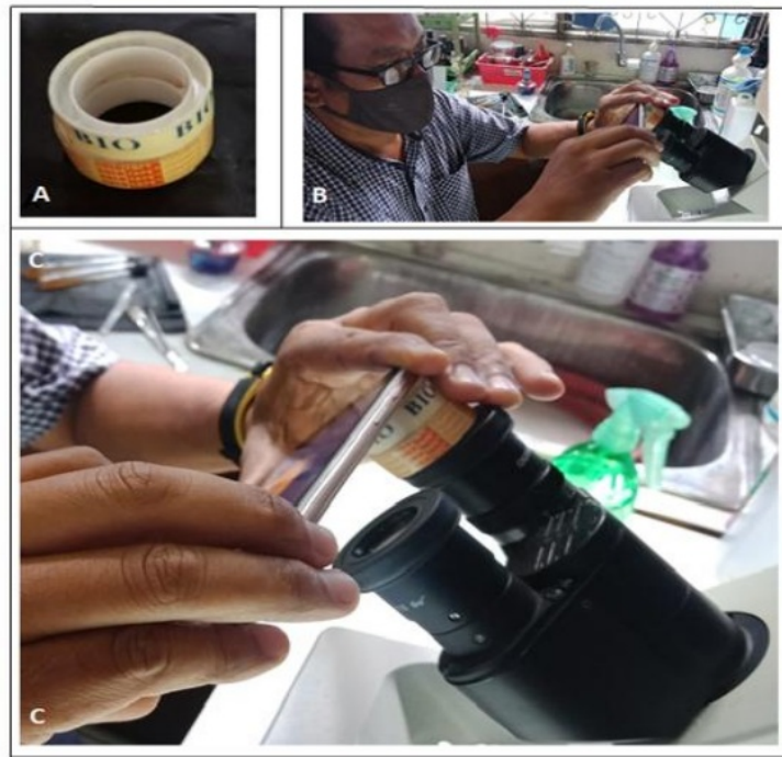
Fig. 1. A. small sized cello tape used as an external adaptor-like for the smartphone. B. Setting the smartphone so that it can rely on the cello tape. C. Left hand can hold the smartphone, and with the free right hand can adjust the microscope settings (e.g. aperture for light), and after the best image seen, the right hand's finger can push the button of the camera