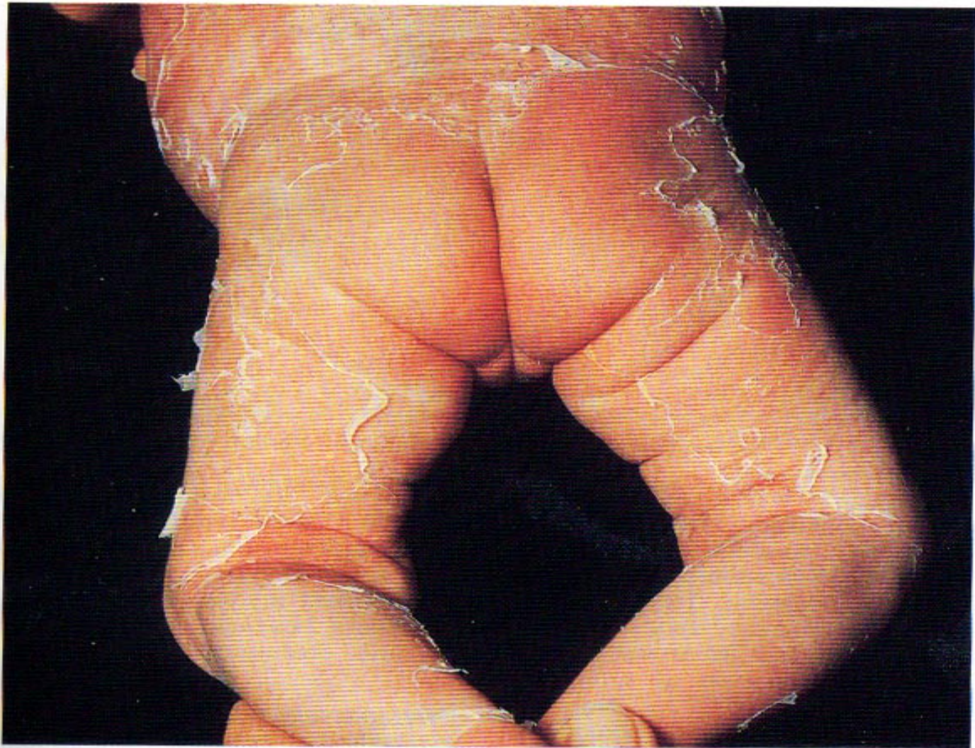
FIGURE 22-33 Staphylococcal scalded-skin syndrome Generalized desquamation following SSSS in an infant.