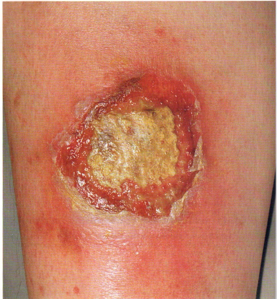
FIGURE 22-14 Ecthyma: S. aureus A large, circumscribed chronic ulcer with surrounding erythema in the pretibial region.