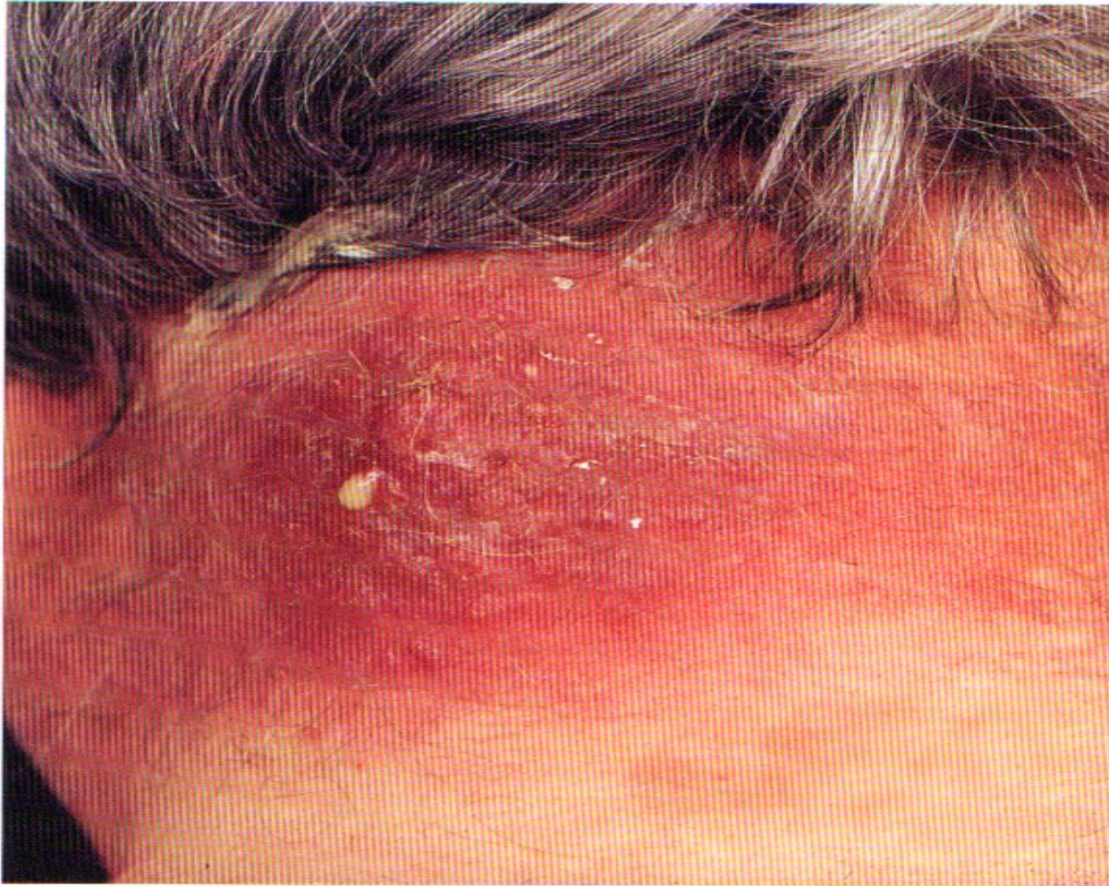
FIGURE 22-19 Carbuncle: S. aureus A very large, inflammatory plaque studded with pustules, draining pus, on the nape of the neck. Infection extends down to the fascia and has formed from a confluence of many furuncles.