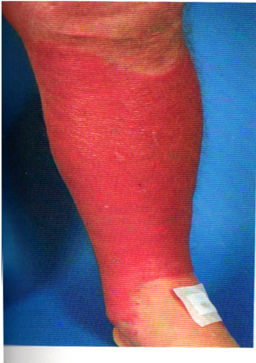
FIGURE 22-22 Erysipelas of leg: S. aureus The lower leg is red, hot, tender, and edematous. Erythematous plaque is well defined. The infection is recurrent with interdigital tinea pedis as the portal of entry.