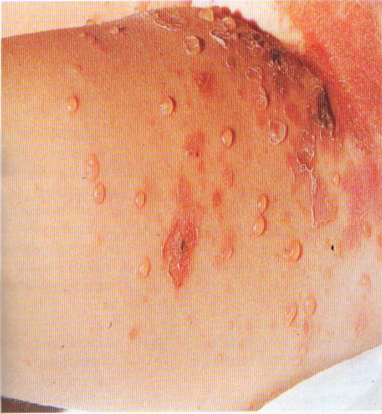
FIGURE 22-12 Bullous impetigo: S. aureus Scattered, discrete, intact thin-walled blisters on the thigh of a child; lesions in the groin have ruptured, resulting in superficial erosions.