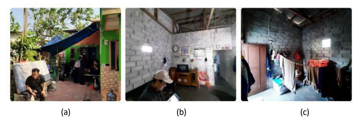
Figure 8. (a) Front of the house (b) family room (c) kitchen area (source: author)