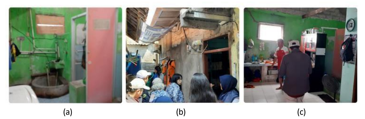
Figure 2. (a) well inside the house (b) outside area of the house (c) inside area of the house