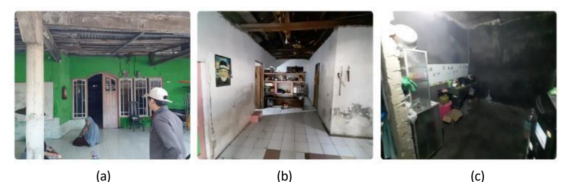
Figure 9. (a) alley of the house (b) 1st open to the front of the house (c)

The 8<sup>th</sup> house of this study is occupied by the H. Family This house, inhabited by a family of six, has a total floor area of approximately 74.2 square meters. The floor is tiled, and most of the walls are plastered. However, the ceiling is exposed to asbestos. The house features a spacious terrace, larger than those of the other 10 houses, used for teaching religious studies in the afternoons and evenings. Besides the terrace, there is a living room, three bedrooms, a kitchen, and two bathrooms. A rear exit is available, but windows are only found in the living room facing the terrace and a side section of the terrace facing the long hallway. The hallway, measuring 1.4 meters wide, serves as a rear exit and a storage area. Due to the lack of natural light sources within the house, it relies heavily on artificial lighting. Additionally, high humidity levels have resulted in mold growth on the interior walls.