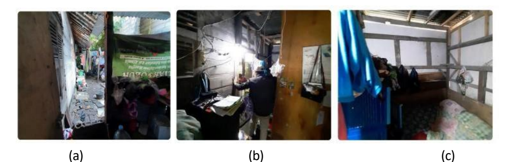
Figure 12. (a) view from kitchen to the outside area (b) the house condition (c) bedroom area

The last house is the smallest house among all the houses in this study where the K family lived. Built as an additional structure attached to the main house where the grandparents of this family reside. This house has 10.8 m<sup>2</sup> area but is used by four people—two adults and two school-aged children.