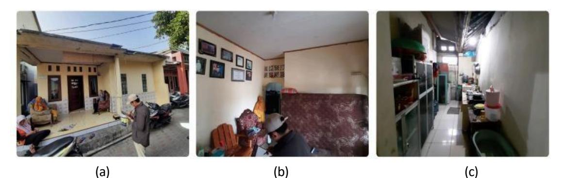
Figure 10. (a) front of the house (b) center of the house (c) kitchen area