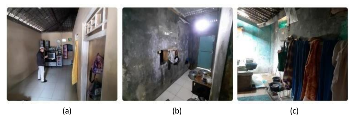
Figure 4. (a) alley of the house (b) 1st open to the front of the house (c)