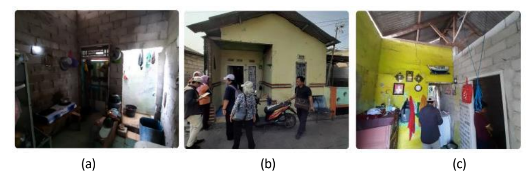
Figure 6. (a) Kitchen and Bathroom area (b) front of the house (c) inside the house