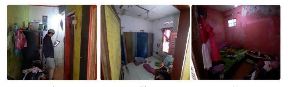
(a) (b) (c) Figure 3. (a) alley of the house (b) 1st bedroom that has a window open to the front of the house (c) 2nd Bedroom that has no ventilation and mold on the wall

Situated in a narrow alley accessible only by a single motorcycle, this house is completely overshadowed by an adjacent two-story building that blocking out the natural light. Its proximity to a dead end, less than a meter away, prevents a clear frontal view. Despite its compact size of 20.7 m2, comprising two bedrooms, a bathroom, and a kitchen, the house is remarkably dark due to the limited openings caused by its confined location. The interior features ceramic tile flooring and plastered walls. This house also has mold growth on the walls, particularly in the rooms that receive no natural light or ventilation at all.