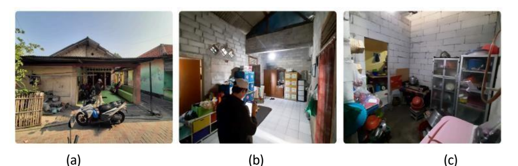
Figure 11. (a) Front of the house (b) the family room (c) kitchen area

This house is occupied by J Family. This house is the largest among the houses included in this study. With an area of 84 m<sup>2</sup>, it has a sufficient number of openings to accommodate its residents. The house features a terrace at the front, and the living room has a window facing the terrace, providing adequate lighting in the front part of the house. It also has three bedrooms, one kitchen with a separate dining area, and two bathrooms. Seven people reside here, with the facilities mentioned earlier; however, due to the large number of items in the back area and the limited openings there, the back part of the house is damp, with mold forming on the interior walls. Additionally, the back area still relies on artificial lighting. The house has ceramic flooring, but the walls are made of lightweight bricks that not plastered.