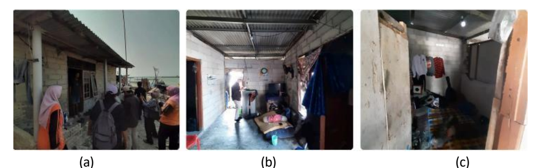
Figure 5. (a) Front of the house (b) inside of the house (c) bedroom

This house features two bedrooms that face the living room, with no windows except for the bedroom doors. The bathroom is located at the rear of the house, combined with the kitchen and laundry area with a total floor area of 35 square meters. The house has only one window in the living room, relying primarily on the front and side doors that open directly onto the sea. The front part of this house is also used for cleaning and even drying fish caught by fishermen, resulting in a rather unpleasant odor.