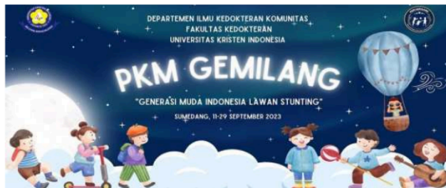
Figure 1. PkM Gemilang Activity Banners in 7 Villages in Rancakalong District, Sumedang Regency

Health service activities to the community as one of the real forms of academic involvement in solving community problems, especially regarding stunting which is still a major problem in Indonesia. Stunting is short or very short stature based on length/height according to age which is less than -2 Standard Deviations (SD) on the WHO growth curve, caused by chronic malnutrition related to low socioeconomic status, poor nutritional intake and maternal health, history of repeated illness and inappropriate feeding practices for infants and children. Stunting causes obstacles in achieving the physical and cognitive potential of children. The growth curve used to diagnose stunting is the WHO child growth standard curve in 2006 which is the gold standard for optimal growth of a child. This public health service activity, in general, was carried out very well thanks to the support of various parties starting from the Indonesian Christian University, specifically the Faculty of Medicine, to the local government in Rancakalong District, Sumedang Regency, West Java.