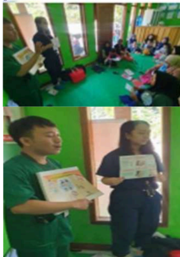
Figure 1. Documentation of the Speaker's Presentation Session on Scabies

The presentation was carried out by UKI lecturers together with students as documented in Figure 1 below: