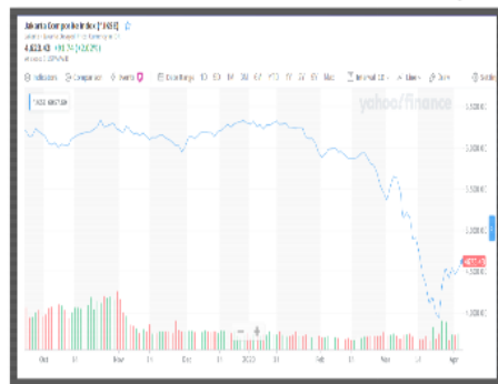
Figure 2. Monthly Jakarta Composite Index

These 2 charts will represent the different prospect of the market. By observing the trend, it seems like there's no prospect for the stock market if we see the Jakarta Composite Index monthly. It's referred to the uptrend. On the other side, we've got a different perspective if we examine the daily chart, as we can see in Figure 3. There's the prospect for the stock market on 13, 20, 26 and 27 March 2020. It's referred to downtrend. Assuming all of the investors optimistic about the market without doing the massive selling, the market will be just fine and there's no recession in the future. We commonly know this as demand and supply law.