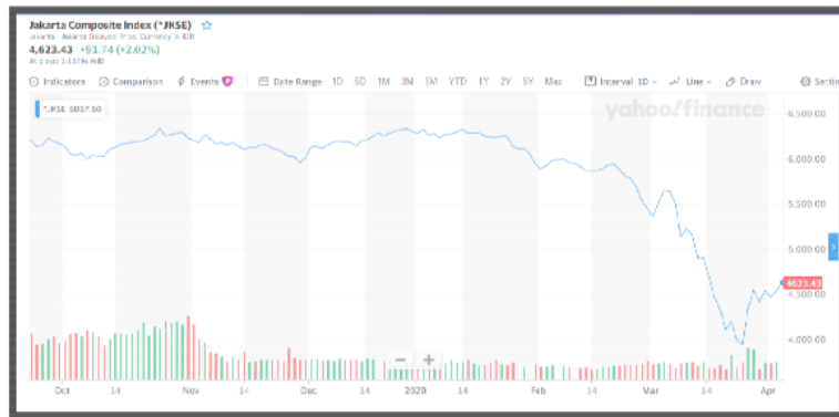
Figure 4. Jakarta Composite Index

Indonesia Stock Market has been decreasing since the beginning of 2020 because of the Coronavirus that lead to panic reactions to the market.