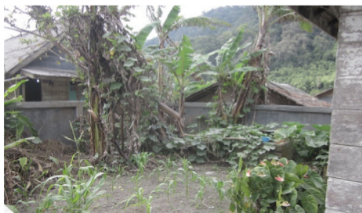
Figure 2. The home garden structure of Batak Karo sub-ethnic in Karo District, North Sumatra, Indonesia

In this study, 30 species of home garden plants used as medicine such as to overcome the fever ( H. rosa-sinensis , Ceiba pentandra , E. elatior ), digestive tract disorders ( C. longa , Curcuma xanthorrhiza , Zingiber officinale ), traditional steam-bathing ( Z. officinale , E. elatior , C. longa , Cymbopogon citratus ), and kidney disease ( E. debile ) (Table 1). In Batak Karo sub-ethnic, more food plants were planted in home garden (species) compared with medicinal plants. Community used home garden as a source of food and income (Galhena et al. 2013), especially fruit, vegetable, staple food (Sujarwo and Cavera 2015). Farmers always ensure the availability of food plants in the garden (Lok 2001), especially in the difficult plant season times. The home garden is an easy and accessible place for a food source (Sujarwo and Cavera 2015).