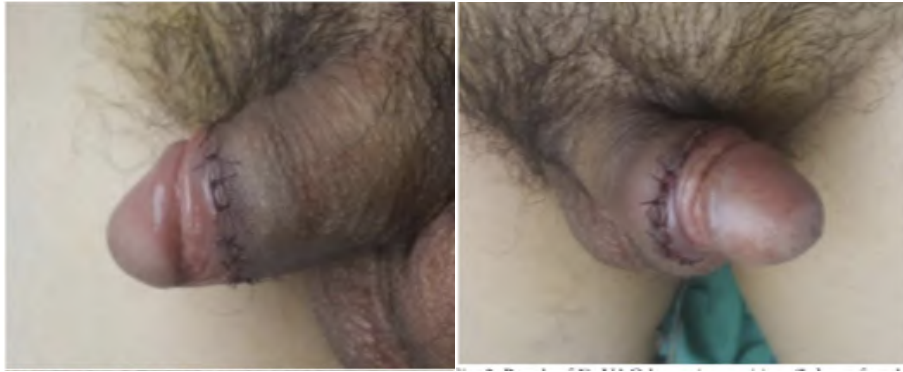
Gambar 2. Hasil Er:YAG laser (setelah 5 hari tindakan)