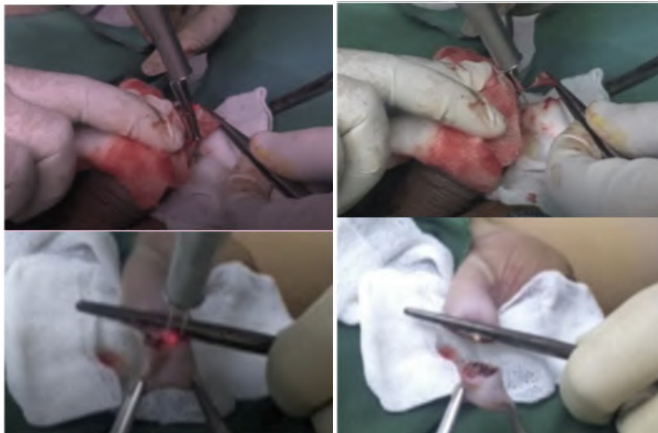
Gambar 1. Prosedur Er:YAG

menggunakan R08 handpiece dengan durasi pulse MSP (100us), 50 Hz dan 140 mJ, kita melepaskan kulit prepusium dengan meminimalkan kerusakan jaringan. Pada bagian yang memiliki vaskularisasi lebih banyak kami menggunakan R08 dengan durasi pulse LP (600 us), 20 Hz dan 180 hingga 200 mJ, dimana akan terjadi pemotongan dan koagulasi bersamaan. Setelah itu akan dilakukan jahitan simple dengan teknik simple dikombinasi interrupted pada bagian yang dirasa perlu menggunakan Vicryl 3.0. Setelah tindakan akan diberikan salep antibiotic (Otogenta) selama 5 hari. Pasien juga diberikan antibiotic minum sefadroksil 500 mg. Kami merekomendasikan agar pasien menjaga kebersihan area tindakan menggunakan cairan steril, karena air tanah di Indonesia terkontaminasi bakteri. Benang jahit tidak perlu diangkat karena menggunakan material yang dapat diabsorpsi oleh tubuh, meskipun terkadang dapat dilakukan pengguntingan agar pasien merasa lebih nyaman pada hari 10-14 setelah tindakan.