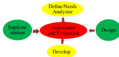
Figure 1. Logarithmic module research flow

This study uses a Research and Development (R&D) approach to define, design, develop, implement, and evaluate strategies (Mavrotas & Makryvelios, 2021). The product developed in this research is a math module for logarithms. This module is a tool for learning logarithmic material in class and can be used by students at home (Mishra et al., 2020). The following is the development research flow used.