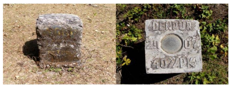
Figure 2. Boundary Conditions at the RI-RDTL Border

Delimitation of the Indonesian border with Timor Leste on the island of Timor refers to the agreement between the Government of the Netherlands East Indies and the Portuguese in 1904 and the Permanent Court Award (PCA) 1914, and a temporary contract between Indonesia and Timor Leste on 8 April 2005. Border negotiations between Indonesia and Timor East Timor began in 2001 with the first meeting of the RI-UNTAET (United Nations Transitional Administration for East Timor) Technical Sub-Committee on Border Demarcation and Regulation (TSCBDR). The national boundary between Indonesia and Timor Leste totaling 907 coordinate points was established in the Provisional Agreement, which was signed by the Indonesian Foreign Minister and the Timor Leste Foreign Minister on 8 June 2005 in Dili. However, there are still unsolved and unresolved segments. They are surveyed by the Survey Team of the two countries. Specifically, the border in the One enclave, which is in accordance with the agreement between the Dutch colonial government and the Portuguese October 1, 1904 stairs regarding the border between Oune-Ambeno, has a length of 119.7 km starting from the mouth of Noel Besi to the mouth of the river (Thaleug).