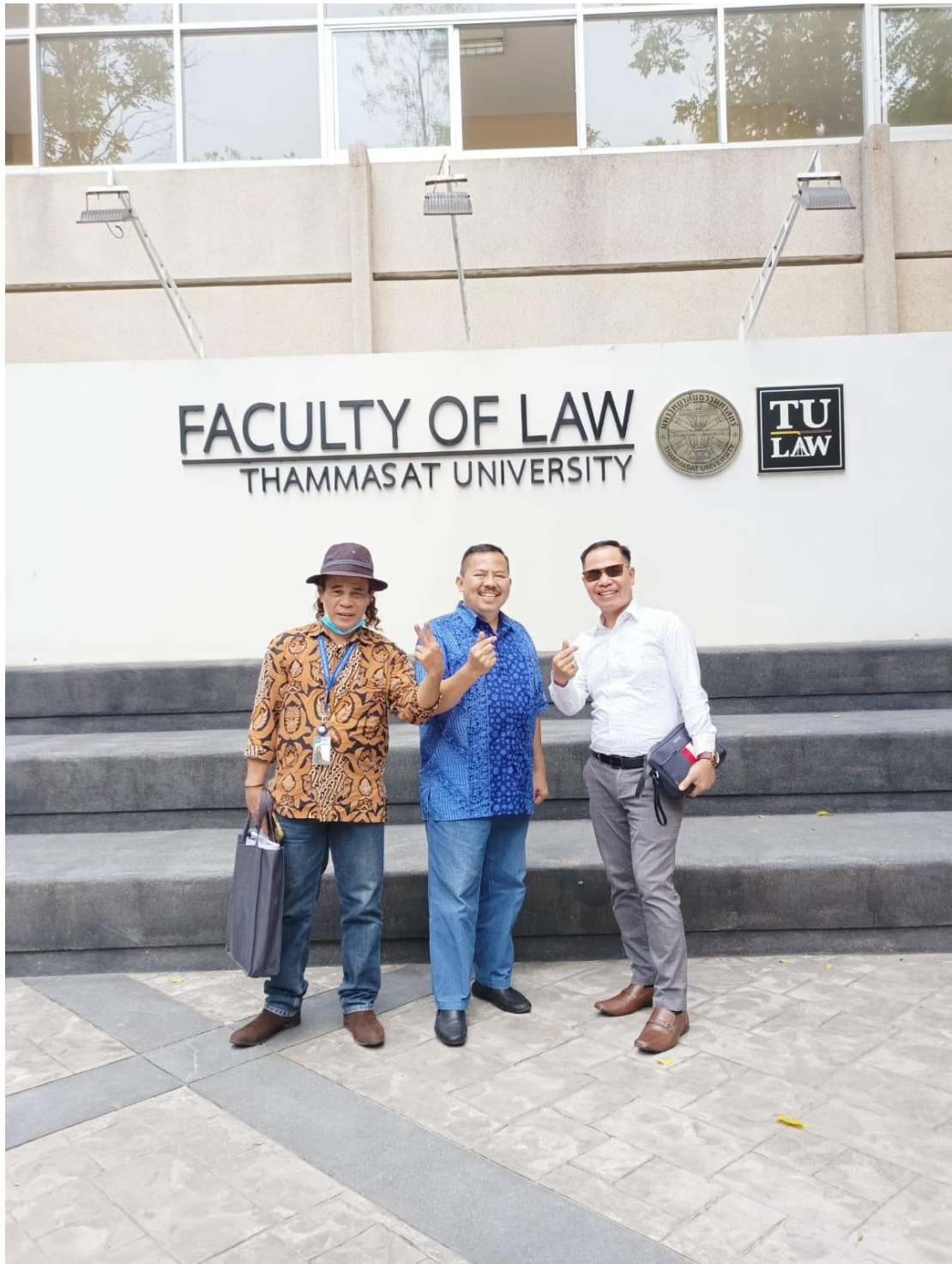
Picture 1, 2, 3: The Benchmarking Team from the UKI Master of Laws arrived at the Faculty of Law, Thammasat University, Bangkok.