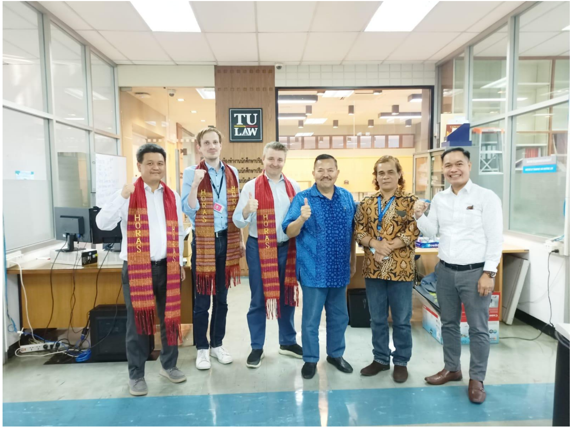
Picture 6: Providing souvenirs to the team from the Thammasat University Faculty of Law