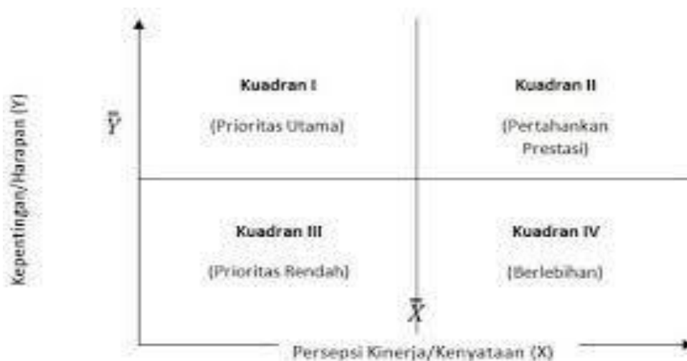
Figure 1. Cartesian diagram

To describe the level of satisfaction of PJJ students at the Indonesian Christian University during the Covid-19 pandemic, the authors use the following diagram: