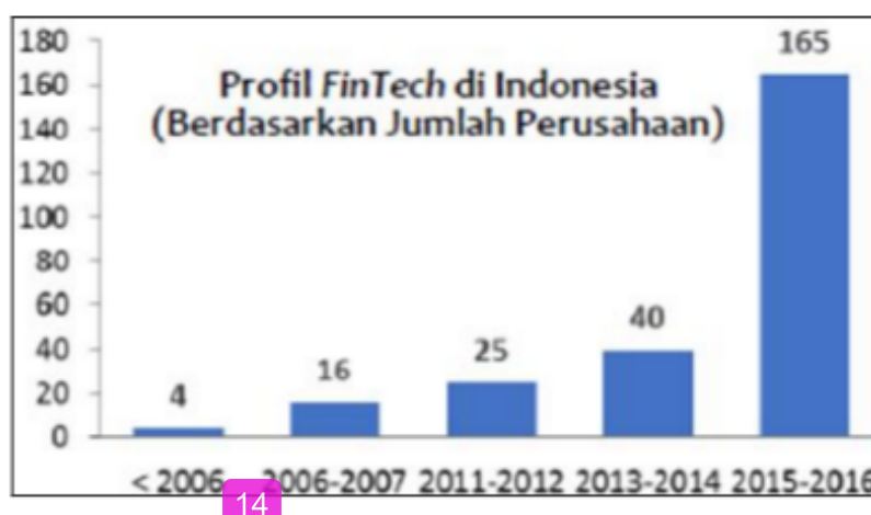
Fig 1: Development of Fintech in Indonesia

Source: Indonesian Fintech Association ( https://fintech.id/ )