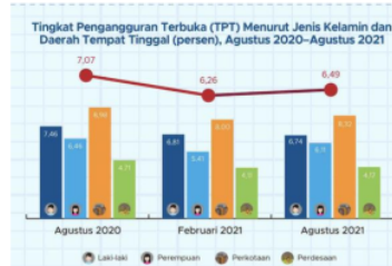
Figure 2. 2021 Unemployment Graph

Meanwhile, during the COVID-19 pandemic in Indonesia alone, more than 60 percent of the industry was closed. The www.med.com page writes that to this day, only around 25,747 industries are still running out of around 40 thousand industries and the workforce is around 17 million. Even in his research (Hanoatubun, 2020) during the Covid-19 pandemic, more than 1.5 million workers were laid off and laid off. Of this amount, 90 percent were laid off and 10 percent were laid off. As many as 1.24 million people are formal workers and 265 thousand informal workers and among them are women and mothers. The increasing proportion of women in the world of work and the global economic crisis due to the current pandemic have made women the target population for job loss. The condition was also exacerbated by the number of mothers who had experienced layoffs as a result of the COVID-19 pandemic, based on www.cnnindonesia.com the Indonesian Minister of Manpower revealed that as of January 2021 there were 623,407 female workers affected by the layoffs of the COVID-19 pandemic, this figure is substantially lower than the total men who have been laid off. However, the burden experienced by women who experience layoffs is greater than that of men.