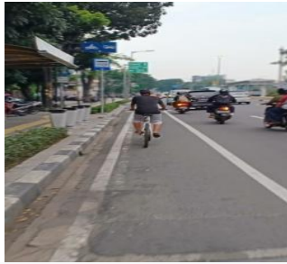
Figure 1. Lane of bicycle on Pemuda Street

It is known that Jakarta has several special bicycle lanes, both on sidewalks and roads. The length of these bicycle lanes will remain limited (Sunandar & Tia, 2020). The limited amount of infrastructure, such as signs, road markings, street lighting, and information boards that are poorly maintained, is a condition of the area. One of the bicycle lanes on the roadways is on Pemuda Street, East Jakarta (Figure 2).