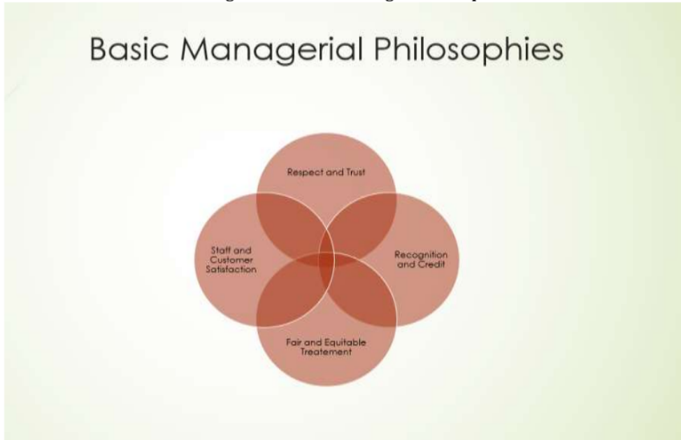
Figure 3: The Basic Managerial Philosophies

Figure 3 creates the idea how religious human religious management is bound of the values of human resources management. This forms the values, where human resources management reflects the idea of religious values as the founding elements to establish the merit of religious human resources management such as: