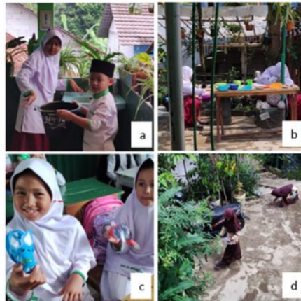
Figure 1. Implementation of Students' Environmental Care Behavior; (a) Daily Picket; (b) buying food using container; (c) waste management activities; (d) students picking garbage in the field.

The last result concerns the students' interviews related to personal knowledge and experience. Students have very good environmental care behavior. Respondents apply a clean and healthy lifestyle at school and in their houses. It started with sweeping and mopping the floor, throwing trash in its place, and washing dishes. However, each respondent assessed that the school environment and residence were still dirty.