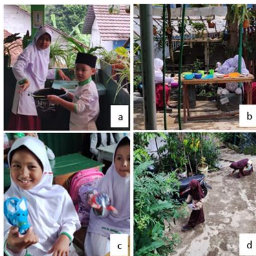
Figure 1. Implementation of Students' Environmental Care Behavior; (a) Daily Picket; (b) buying food using container; (c) waste management activities; (d) students picking garbage in the field.

The last result concerns the students' interviews related to personal knowledge and experience. Students have very good environmental care behavior. Respondents apply a clean and healthy lifestyle at school and in their houses. It started with sweeping and mopping the floor, throwing trash in its place, and washing dishes. However, each respondent assessed that the school environment and residence were still dirty.