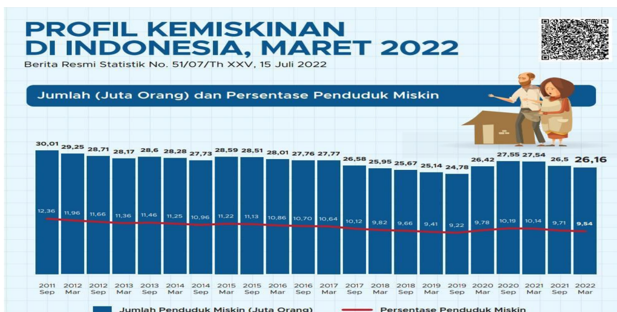
Figure 1. Poverty profile in Indonesia in 2011-2022

Based on these data, it can be concluded that the poor in Indonesia reach 26.16 million people while the total population of Indonesia is 275.36 million people, this will certainly also have an impact on access to legal aid services for the poor, because people who are incapable certainly cannot pay for the legal services of an advocate to accompany him if he or his family is experiencing legal problems and this happens to the poor in Indonesia which currently numbers 26.16 million people.