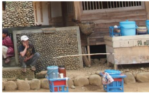
Fig. 11. Stones used in the Houses in Kampung Naga