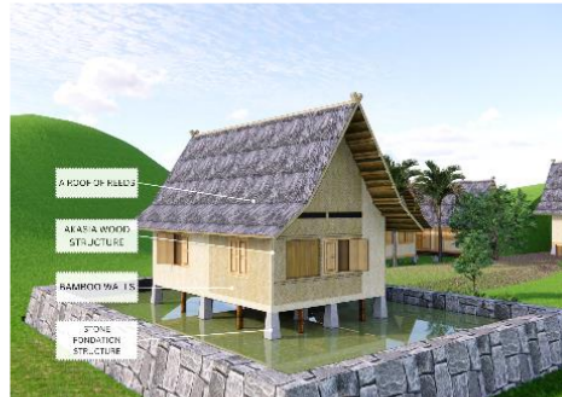
Fig. 5: The House of Kampung Naga