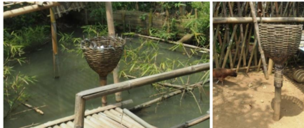
Fig. 10. Trash Cans in Kampung Naga Source: Sudarwani et.al, 2022