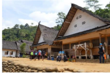
Fig 3: Bale Patemon and Kampung Naga Mosque