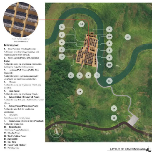
Fig. 2. Siteplan of Kampung Naga

The location of the settlements in Kampung Naga has a pattern that spreads according to the availability of land based on the customary rules. Most houses face each other and are required to face North and South. The landscape of Kampung Naga is hills with fertile soil (Fig 3). It consists of three parts: the forest area, the residential area, and the outer area (dirty area). In this pattern, there are three elements which mutually support the fulfillment of the daily needs: 1) The house is as a place to live, and shelter from the wild animals. Sundanese houses use natural materials and are friendly to the environment; 2) A source of water is always available for the fulfillment of survival, whether raising fish, irrigating rice fields, cultivating crops, or for other needs; and 3) The pattern of the settlements, and the village spatial planning maintain the contour patterns and environmental balance.