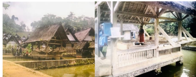
Fig. 13. Saung Lisung in Kampung Naga