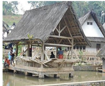
Fig. 4: Saung Lisung in Kampung Naga