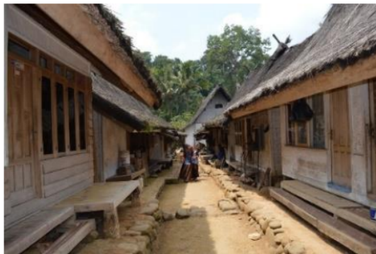
Fig. 8: Circulation Path Between Residential Houses in Kampung Naga