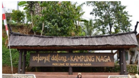
Fig. 12. Gate in Kampung Naga