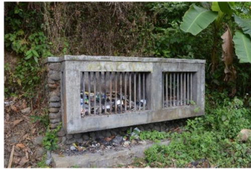
Fig. 9. Garbage Enclosure in Kampung Naga