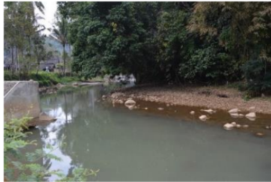
Fig. 7: Ciwulan River