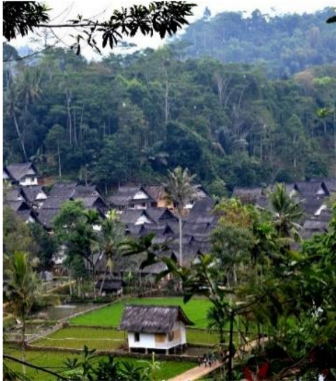
Fig. 6: The Culture of Respecting Nature in Kampung Naga