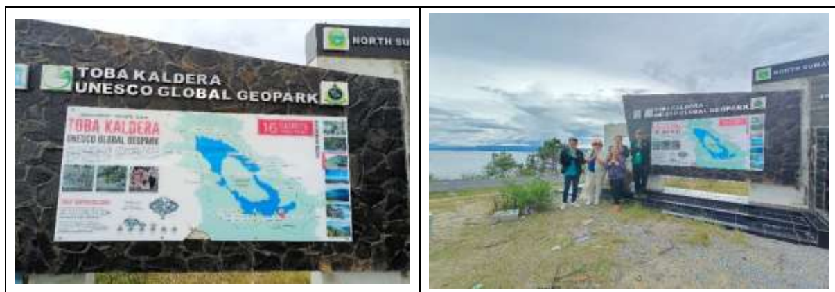
Figure 1. Tourism Area Bukit Singgolom is included in One Toba Caldera Unesco Global Geopark

cultural sites, and biodiversity on an ongoing basis. Unesco's recognition of the Toba Caldera as a UNESCO Global Geopark is early evidence of the awareness that Lake Toba needs to be developed by relying on the concepts of geodiversity , biodiversity , and cultural diversity . In this case, building Toba Lake is only sometimes for economic reasons. (Bangun & Junita, 2020)