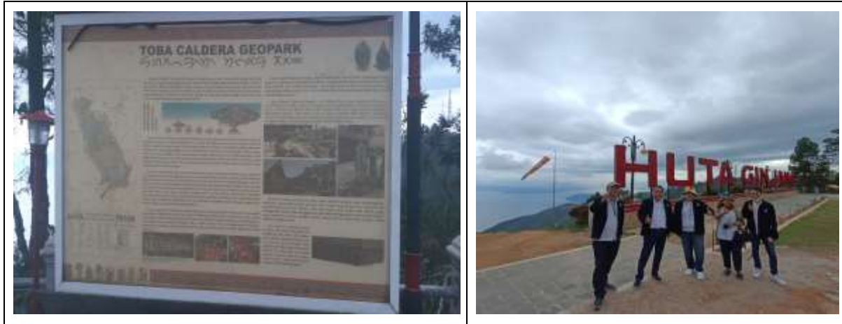
Figure 3. Tourism Area Huta Ginjang included Geopark is included in One Toba Caldera Unesco Global Geopark

Caldora, the Government and the local community are obliged to improve and maintain environmental sustainability and the integrity of the Toba Caldora Area." (KBRI in Paris, 2020).