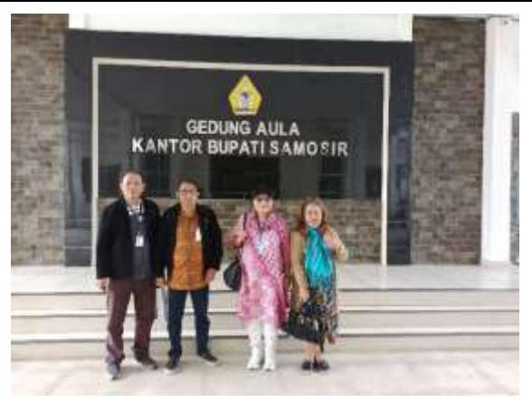
Figure 2. Heading to the Samosir Regency Regional Government Office