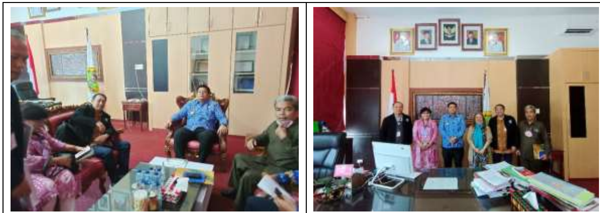
Figure 5. Discussion with the Regent of Samosir Regency with the Expert Team

that were only temporary but not sustainable.