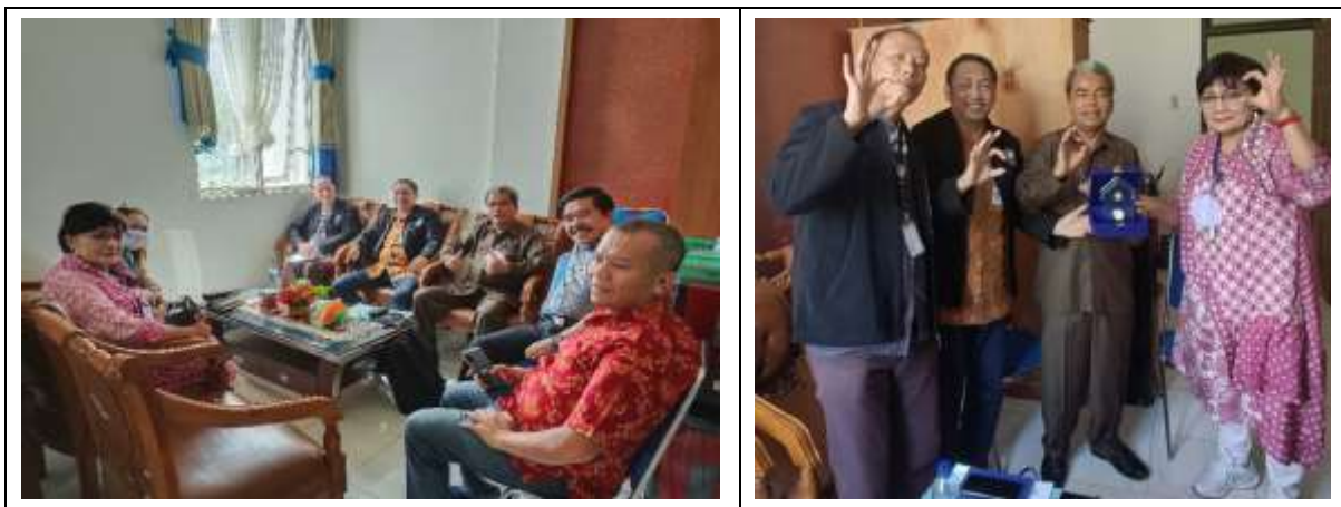
Figure 4. Discussion with the Unesco Global Geopark Toba Caldera Chairperson at the Regional Government Office of Samosir Regency, North Sumatra Province

support from the central, provincial, and private sectors, and c). Local cultural potential and regional biodiversity. Need to take advantage of strengths in using existing opportunities, namely: a). The existence of a geosite as UNESCO Geopark Global, b). Enthusiasm in tourism, and c) Stimulus for world tourism actors). All Regency Regional Governments to show more seriousness in following up on the results of meetings or meetings regarding inter-regional cooperation in the development of the Lake Toba Area.