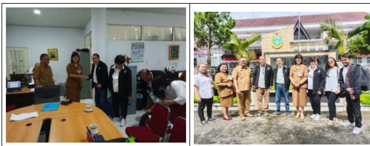
Figure 6. Discussion with the Tourism Office of North Sumatra Province

synergize to support each other and cover various shortages of funds. The provincial Government hopes that the Central Government will provide an adequate budget. Moreover, Toba Caldera is preparing for re-certification and revalidation from UNESCO to avoid being thrown from the UNESCO Global Geopark list. Because Lake Toba is still included in the UNESCO Global Geopark, it has a strategic impact and has become known worldwide.