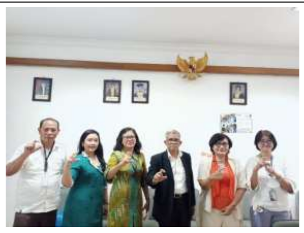
Figure 7. Discussion with the UNESCO Global Geopark Toba Caldera Management Body (Research and Development) with the Faculty of Economics and Business Universitas Kristen Indonesia