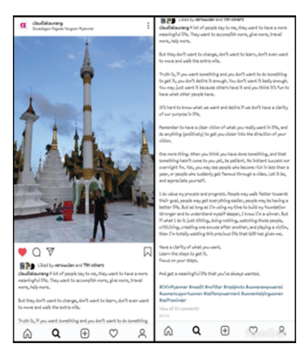
Figure 3: Kaunang in Myanmar

A dynamic life encourages everyone to dare to change and do something in their life. Throught her post in Figure 3, Claudia encouraged women not only complain but also dare to do something for their life. When a woman feels unhappy in her life, she must have the courage to fight. In the process of achieving happiness, women must dare to change and be patient through the process. Because in reality women are often trapped and afraid to get out from the comfort zone created by "master narratives".