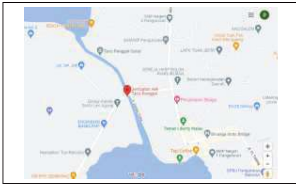
Figure 1 . Map of Tano Ponggol (Google Maps)

including users related to a sense of attachment to the area, history, and culture, access, and circulation, as well as visual characters related to the physical characteristics of the waterfront area in the form of distinctive shapes, materials, vegetation, or activities." (Yudha&Aulia, 2019)