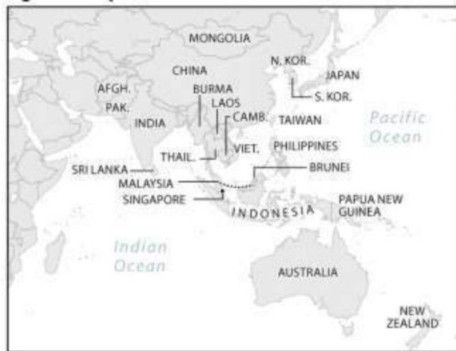
Figure 1: Map of the Indo-Pacific (crsreports, 2022)

The Indo-Pacific idea has existed since the end of the 20th century. After World War II, in the 1960s, Asia-Pacific dominated the Asian conception. "It is generally understood as the region linking Northeast and Southeast Asia with Oceania (and therefore Australia) and the Americas. A large part of the purpose of this idea is to reflect and strengthen the important strategic and economic role of the U.S. in Asia, as well as the success of East Asian industrialized countries as U.S. trading partners. Asia-Pacific reached a new level of relevance and institutionalization in the late 1980s with the establishment of the Asia-Pacific Economic Cooperation (APEC) process. The Asia-Pacific concept began to falter with two factors that emerged in the 1990s. First, India's rise as a substantial economic and military power with interests beyond South Asia. Second, the increasing connection between the economic powers of East Asia and the Indian Ocean region related mainly to the demand for energy and other resources" (Medcalf, 2018).