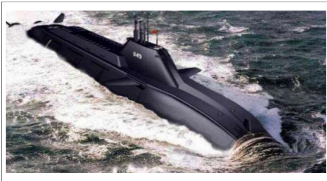
Figure 3: China's 095 SSN Nuclear Attack Submarine (Red Square, 2021)

China Sea. With the Code of Conduct, ASEAN and China hope that disputes over claims in the South China Sea can be actively resolved against the two countries, namely China and the United States. (Sutrisno & Meirinaldi, 2020)