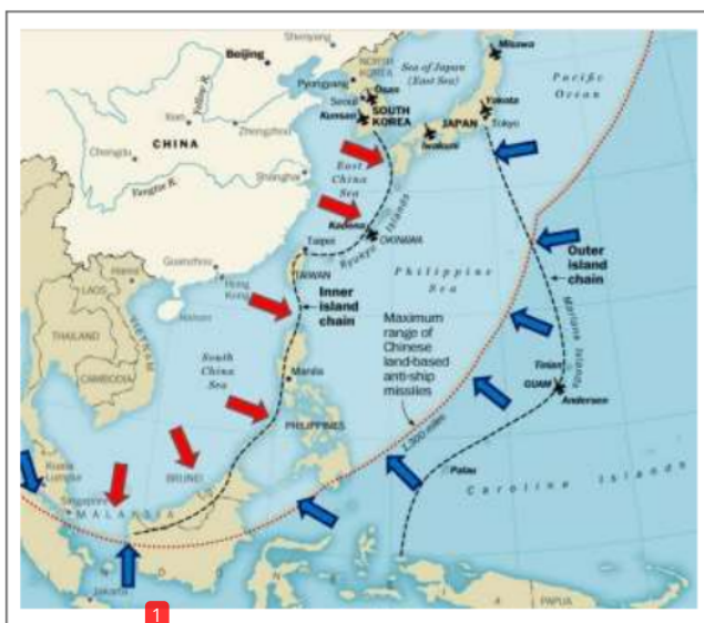
Figure 2: Locations and chains of Chinese and U.S. military Bases in the Indo-Pacific Region (Red Square, 2021)

Japan and Britain are the United States' closest allies with a common interest in "restraining influence" China in the South China Sea. The United States, Britain, and Japan are concerned that China could gain control of the trade routes linking Asia with Europe and the United States. China's dispute with Japan over the island of Shinkoku, as well as China's with Vietnam, Taiwan, Malaysia, and the Philippines over the Spratly and Paracel islands in the South China Sea, have added to geopolitical tensions in the Asia Pacific Region. (Republika, 2018)