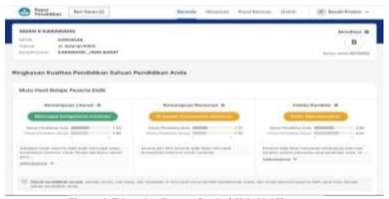
Figure 4. Education Report Card of SMAN 6 Karawang

The results of the ANBK literacy report on education at the Pengmobil High School in Karawang district as a whole are very good which are marked in green and blue.