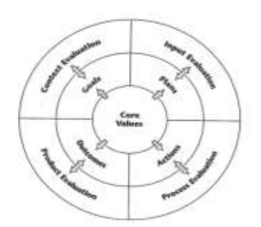
Figure 3. CIPP Model

model is appropriate in this GLS program research because the focal point of the CIPP model is the factors that influence the success of a program (Nurhayani, Yaswinda & Movitaria, 2022). Data collection techniques in this study used document studies, interviews and observations. Data analysis in this study was carried out by triangulating data sources.