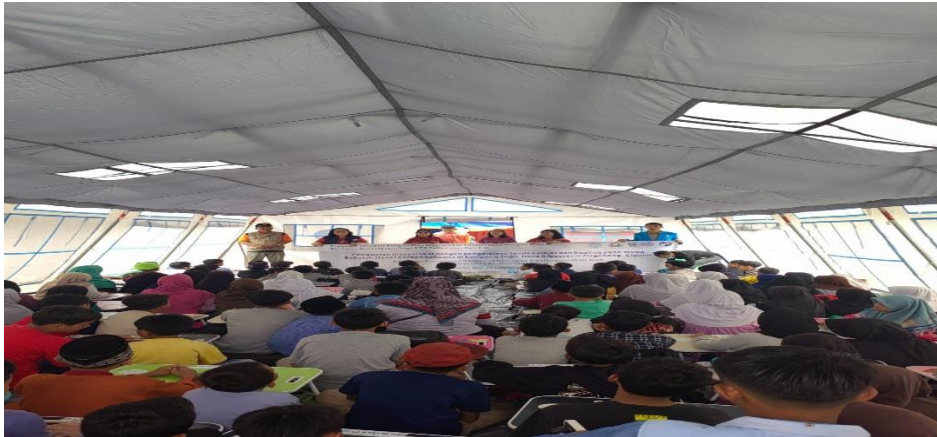
Figure 7. Grades 5-6 of Elementary School Students in the Study Tent