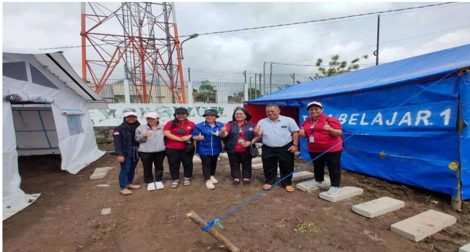
Figure 3. The Study Tent is Ready to Use

The government quickly provided aid, as well as people who cared about the earthquake. UKI also cares for and wants to share as an implementation regarding to one of UKI's values. Learning must be carried out because it is already a formal education program. Because of the condition is still an emergency response, the learning carried out by the teacher cannot be implemented under the provisions that should be, but how can the children want and keep learning (Wulandari, K.D., 2018). In Tugu Village, Cibereum Village, there is an elementary school with 485 students. The initial step taken by the UKI PkM Team was to set up study tents and the necessary facilities. Lessons are held in a tent alternately twice a week. Learning tents with assistance from UNICEF, the Ministry of Education and Culture and UKI. The formal learning process is held in only one location guided by the teacher and the UKI PkM Team for 2 weeks.