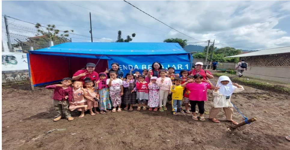
Figure 4. Kindergarten Students Study Accompanied by the PKM UKI Team

Figure 3 shows the study tent set up on the residents' land. PkM activities are held during the rainy season so that the ground is slippery and muddy and turns out the road to the study tent is given hebel bricks as the road to the study tent to help students not be reluctant to come to the study tent. The psychological healing activities consist of stories-telling, ice-breaking, playing, coloring and playing games that train to think. In line with the opinion of Utami, F. B., Uswah, U., Kemal, F., & Nugraha, W. F. (2022) story-telling is an alternative to assist in dealing with trauma.