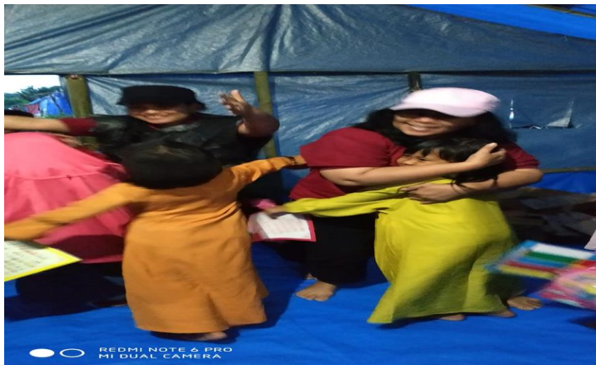
Figure 8. The Children are Close to the PKM Team and Enjoy Learning

Figure 8 shows the school principal and the UKI Team paying attention to students so that they are enthusiastic about learning, bearing in mind that the final semester assessment is delayed and will be held in January 2023. With study assistance from the PkM Team the children are happy, very close even already know and want to say hello first. In addition, Figure 5b shows the children who are very close to and know the UKI PkM Team.