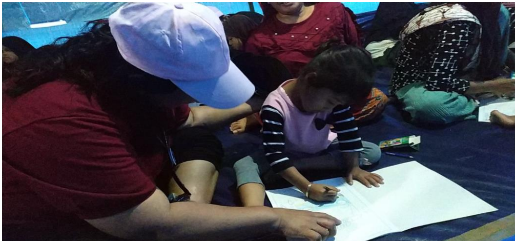
Figure 5. Children Study without Study Tables Accompanied by Their Parents

Children study in tents without study tables and sit on tarpaulins. However, there is an integrated PkM incentive program MBKM Based on Key Performance Indicators (IKU) for Private Universities (PTS) Batch II 2022 Indonesian Christian University to oversee it. On December 12th-15th, 2022 The UKI Team accompanied the children to study and provided counselling to parents about the role of parents in accompanying children to study in refugee camps. UKI facilitates study tents, study tables, whiteboards, and other learning facilities which are distributed to all elementary school students. With this learning facility, the children can write and learn to use a study table at least.