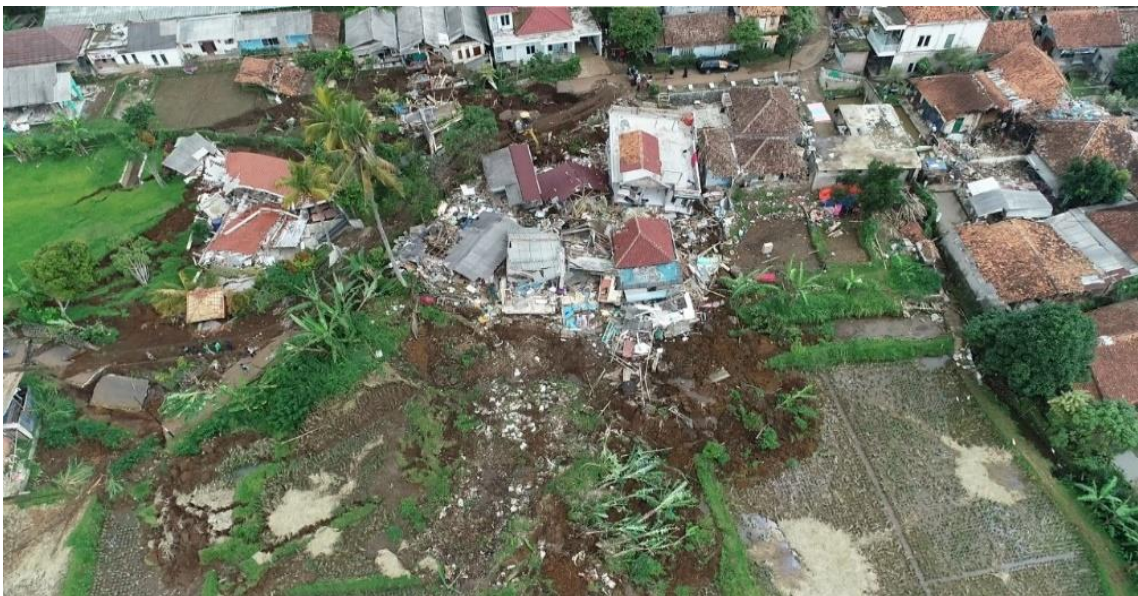
Figure 2. Aerial Photo of the Location of the Ground Movement Triggered by the Earthquake in Cisarua Village, Sarampad Village, Cugenang District

The post-disaster turns the children's feelings to gloom, quiet and afraid of the aftershocks' potential. This situation is called psychological trauma experienced by children and greatly affects their mental development. This condition needs to be handled specifically so that they can rise and recover their mentality. A person who has experienced trauma generally starts from a state of deep and continuous stress that he cannot overcome all alone. While stress is a reaction that arises due to circumstances or events or experiences that burden the mind continuously. The trauma experienced by these children in the long term will result in a heavy psychological burden that can hinder their emotional, social and educational development of children.