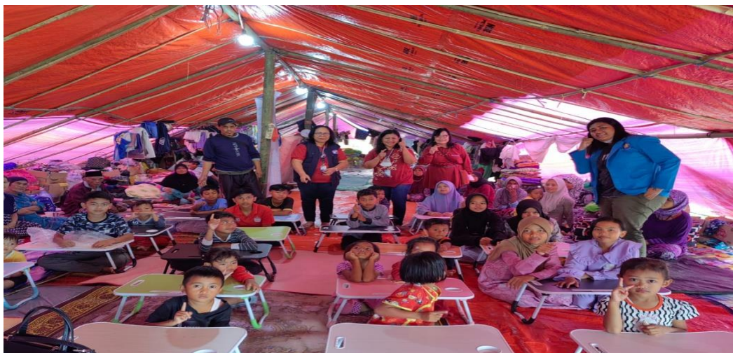
Figure 6. Learning in Tents Using Tables Accompanied by Parents

Figure 5 shows that after the earthquake, with the assistance of the PkM team, the children were willing to learn coloring without a table. Seeing this condition, the UKI team, which is also PkM, provided study tables to make the children more comfortable. Figure 4b shows that the children are more enthusiastic to learn with a desk.