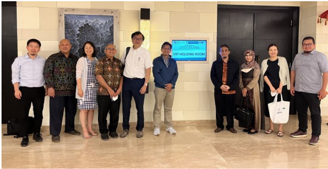
New FAONS member society (About-FAONS/#MNS)