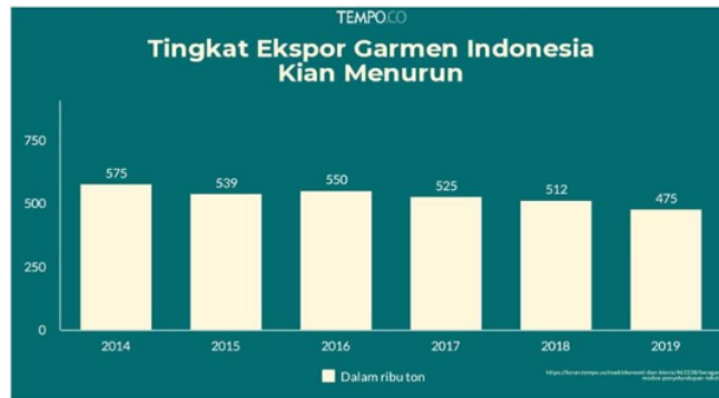
Figure 1: Indonesia's Garment Export Rate Decreasing in 2014-2019