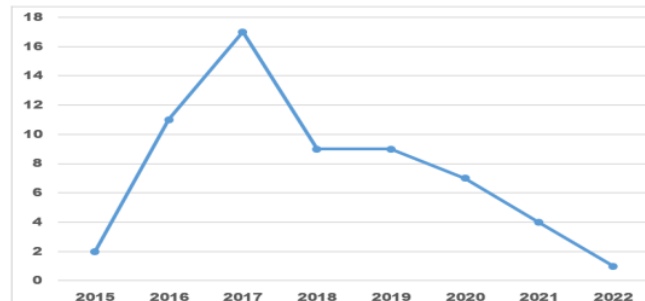
Graph 1: Atambua Customs Success in Overcoming Garment Smuggling 2015-2022