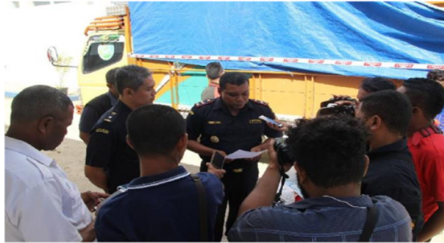
Figure 4: The Failed Smuggling of 177 Sacks of Used Clothes in May 2019 in Belu District

November, and December. In 2022, only one case was found in March. The following is a picture of one of the actions taken by Customs in thwarting smuggling at Selewai Beach, district Belu, NTT.