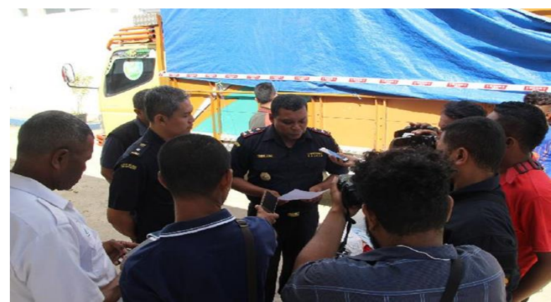
Figure 4: The Failed Smuggling of 177 Sacks of Used Clothes in May 2019 in Belu District

November, and December. In 2022, only one case was found in March. The following is a picture of one of the actions taken by Customs in thwarting smuggling at Selewai Beach, district Belu, NTT.